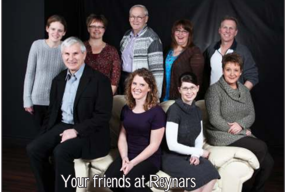
Your friends at Reynars