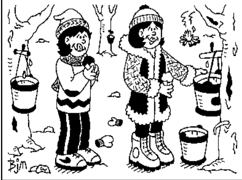
Solution: 1. Handle on pail is hidden. 2. Log by fire is missing. 3. Branch at bottom of tree is different. 4. Pocket on lady's coat is missing. 5. Label on pail is colored in. 6. Boy's maple syrup cone is colored in. 7. Knit on top of hat is moved. 8. Snow behind boy has moved. 9. Hanging pail is tilted. 10. Design on boot is different. 11. Spout on tree is longer. 12. Collar on lady's coat is wider.