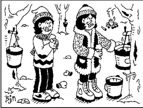
www.comparrotpuzzles.com © 2011 Bonnie J. Malcolm