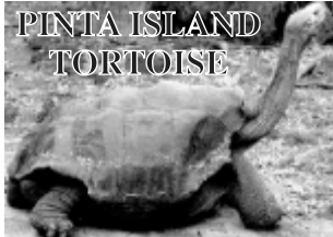
PINTA ISLAND TORTOISE

50 x 70 ft heated, shop with cement floor, could store RV/boat, etc. Few minutes out of Chetwynd. For more information please contact Jeff at 250-788-1656 or 250-242-8484 (cell).